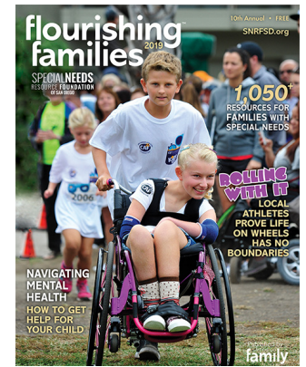
Special Needs Camps