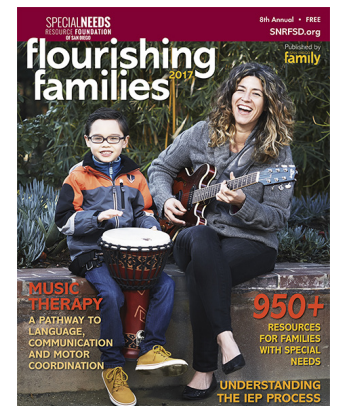
Special Needs Camps