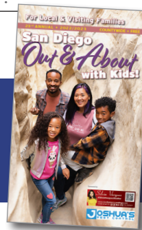
Out & About Deadline May 10