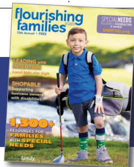
Flourishing Families Deadline Feb. 9